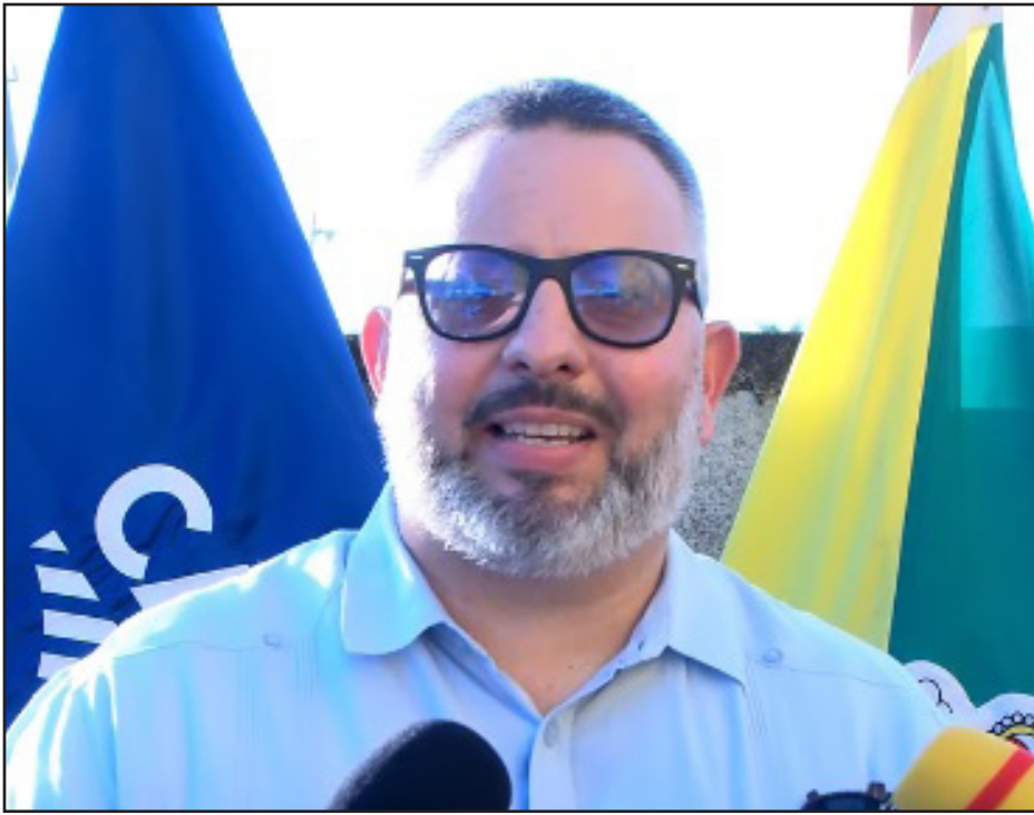
Police Minister Kareem Musa

Since Kareem Musa was appointed Minister of Police, the Belize Police Department has stopped releasing daily Situational Reports (SitReps) to the media in order to control and create a false narrative about improved security. However, residents who live in the real world feel different. Sense of security is as low as ever as there