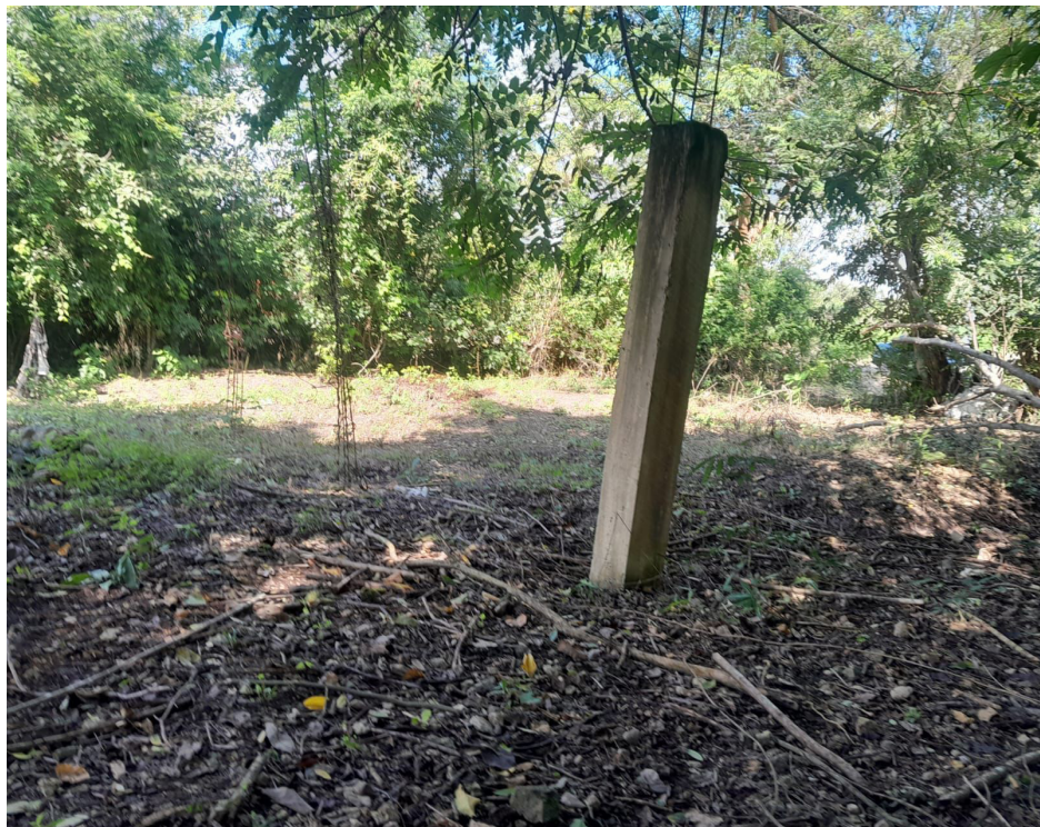
Despite development on the land, the lease was cancelled