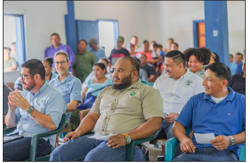
The agreement is a first of its kind

San Benito Poite is the first of three villages in the Toledo District, that are considered under this project, to sign the consent agreement. This milestone marks a significant step towards ensuring that every household