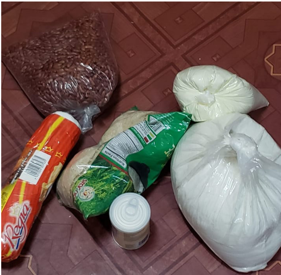
Food distributino has become significantly scaled down

In a surprising turn of events, after three years of eliminating the Food Subsidy Program and reducing the budget for food assistance, Dolores has been instructed to reinstate and expand the provision of food packages