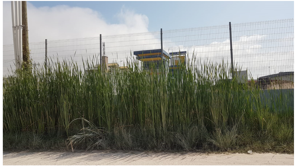
Overgrown grass on Thomas Vincent Ramos Street

We have all heard this old phrase that has become both popular and over used, WWJD – What Would Jesus Do? In fact, it has been used so much that for some it has really just become a worn-out cliché. A simple Google search will reveal that the phrase “What would Jesus do?”, often abbreviated to WWJD, became popular particularly in the United States in the early 1900s after the widely read book In His Steps: What Would Jesus Do? by Charles Sheldon.