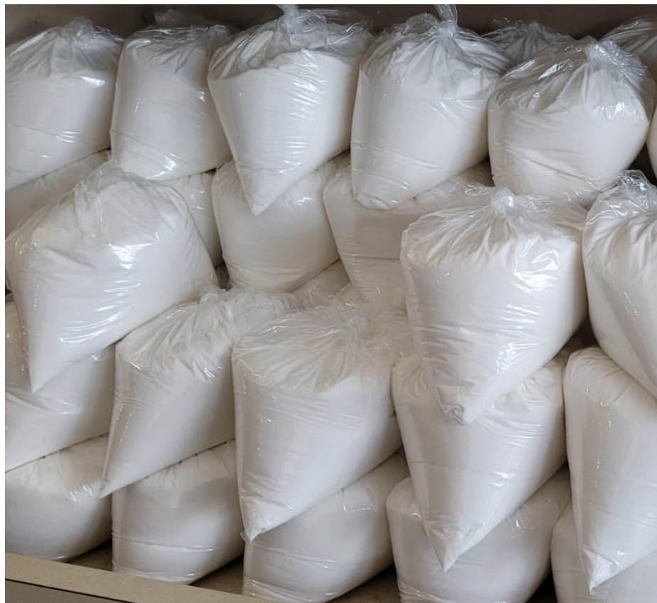
White sugar now sells for $1.60 per pound

Sugar stocks in supermarkets are back to normal after Belize Sugar Industries Limited (BSIL) imported 250 metric tons of plantation white sugar on January 10. With the importation of the sugar came with a more than doubling of the price for sugar from 75 cents per pound to $1.60 per pound.