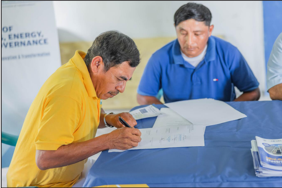
Village alcalde signs Consent Agreement

On Saturday, January 13, 2024, the village of San Benito Poite, in the Toledo District, along with the Government of Belize, officially signed a consent agreement, greenlighting the commencement of a Mini-Grid Electrification project.