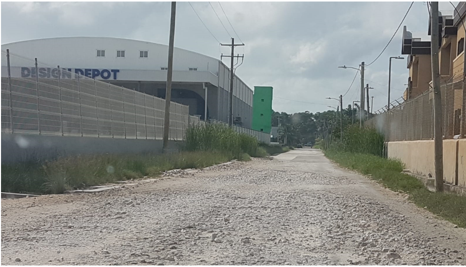
A concrete street has deteriorated to a gravel road