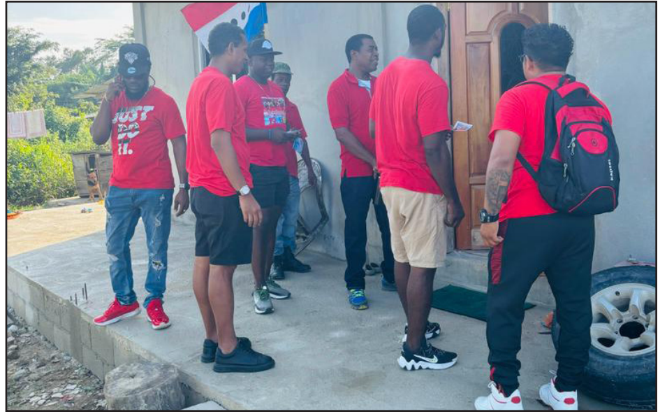
UDP teams are deployed countrywide

With less than fifty (50) days to go before the March 6th Municipal Elections, the Leader of the United Democratic Party, Hon. Dr. Shyne Barrow, is hitting the campaign trail with aspirants and campaigners across the country.