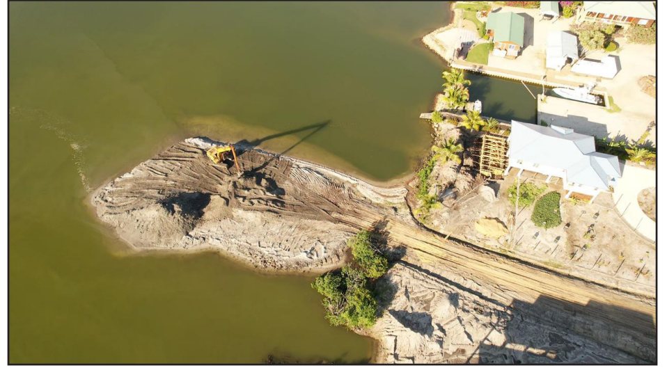
No retaining structures are in place

Environmentalists in the village of Seine Bight are becoming more and more concerned over a development that