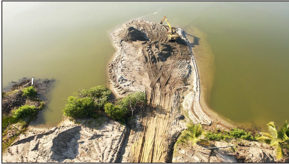
New land is being created