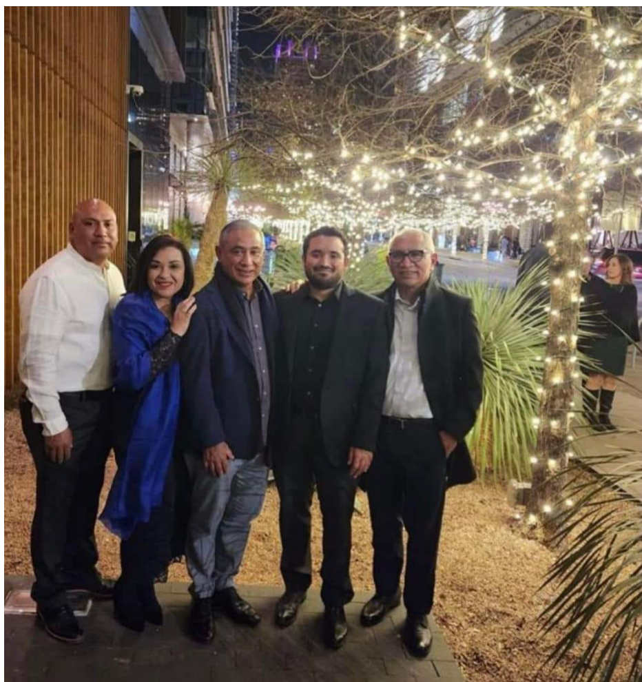
Johnny Briceño enjoying himself in Paris while cane farmers protested

While there is not much that we will yield to PM Johnny Briceño on, we certainly will bow to him whenever he utters the words that as Prime Minister