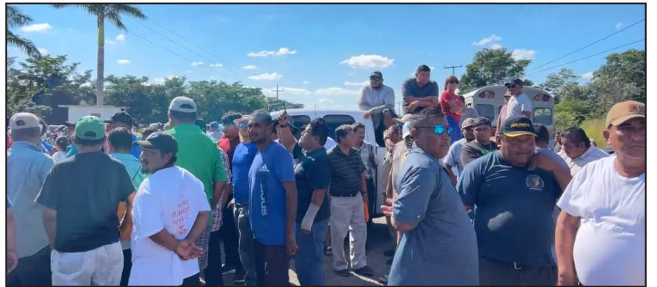
Philip Goldson Highway was blocked by cane farmers

Cane farmers blocked the Philip Goldson Highway for 4 hours on Tuesday, January 2. And on Wednesday, January 3 they were at it again intermittently blocking the flow of traffic on the major artery. With negotiations taking place throughout the day, by 5 BSIL issued a proposal which was rejected by the farmers. The impasse continued even as Briceno himself got involved in the negotiations with no result. The cane farmers would stay at the SIRDI offices until around 7:30p.m. on Wednesday when they lit tires on fire to show their discontent. Negotiations are to continue on Thursday with none of the sides budging.