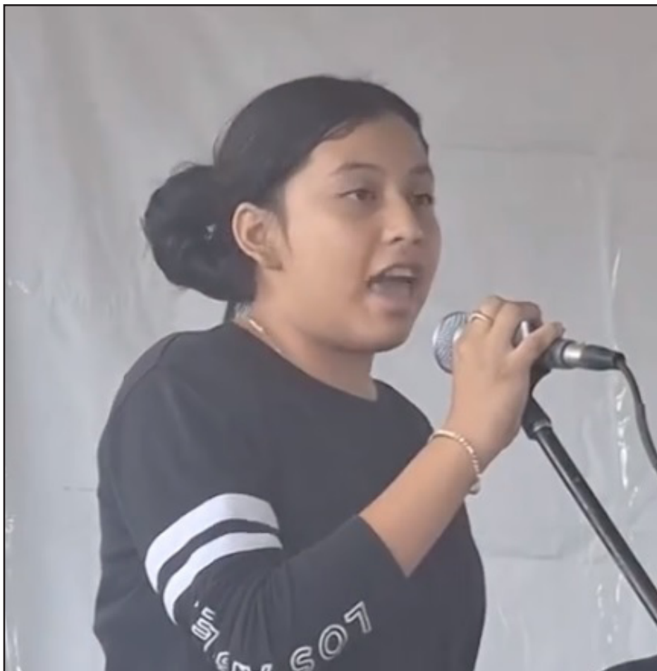
Young lady chiding ministers

The sugar industry once again finds itself in turmoil with the Belize Sugar Cane Farmers Association and the Belize Sugar Industries Limited being unable to reach an agreement for the delivery of sugar cane to the mill. And in the midst of it, there was a meeting of the BSCFA on January 2 at the offices of the Sugar Industry Research and Development Institute where farmers had the opportunity to brace their representatives on their inaction to help resolve the matter.