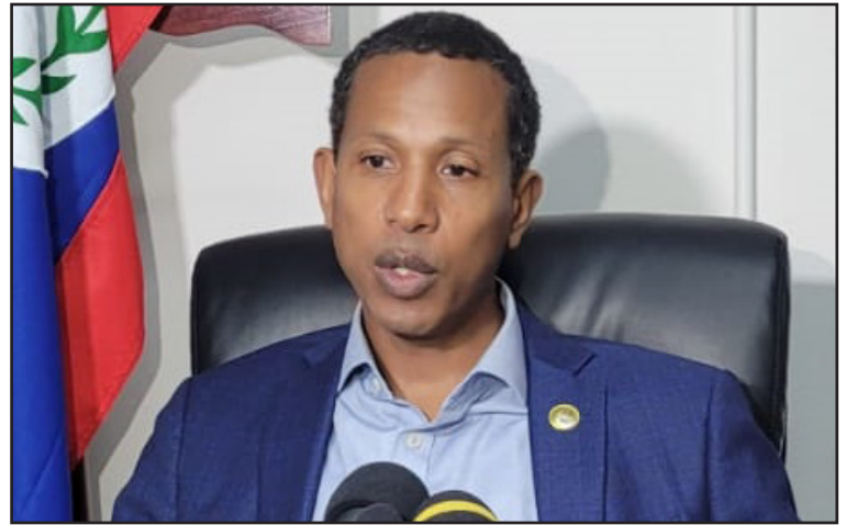
Hon. Dr. Shyne Barrow

Leader of the United Democratic Party, Hon. Dr. Shyne Barrow has called out the Briceno administration for the mishandling of the sugar industry crisis. Hon. Barrow held a press briefing on Wednesday, January 3 in which he stated that he could not understand why after three years there has been no long term solution to the problems of the sugar industry. He was categorical as he stated that lazy management of the country and incompetence are to blame.